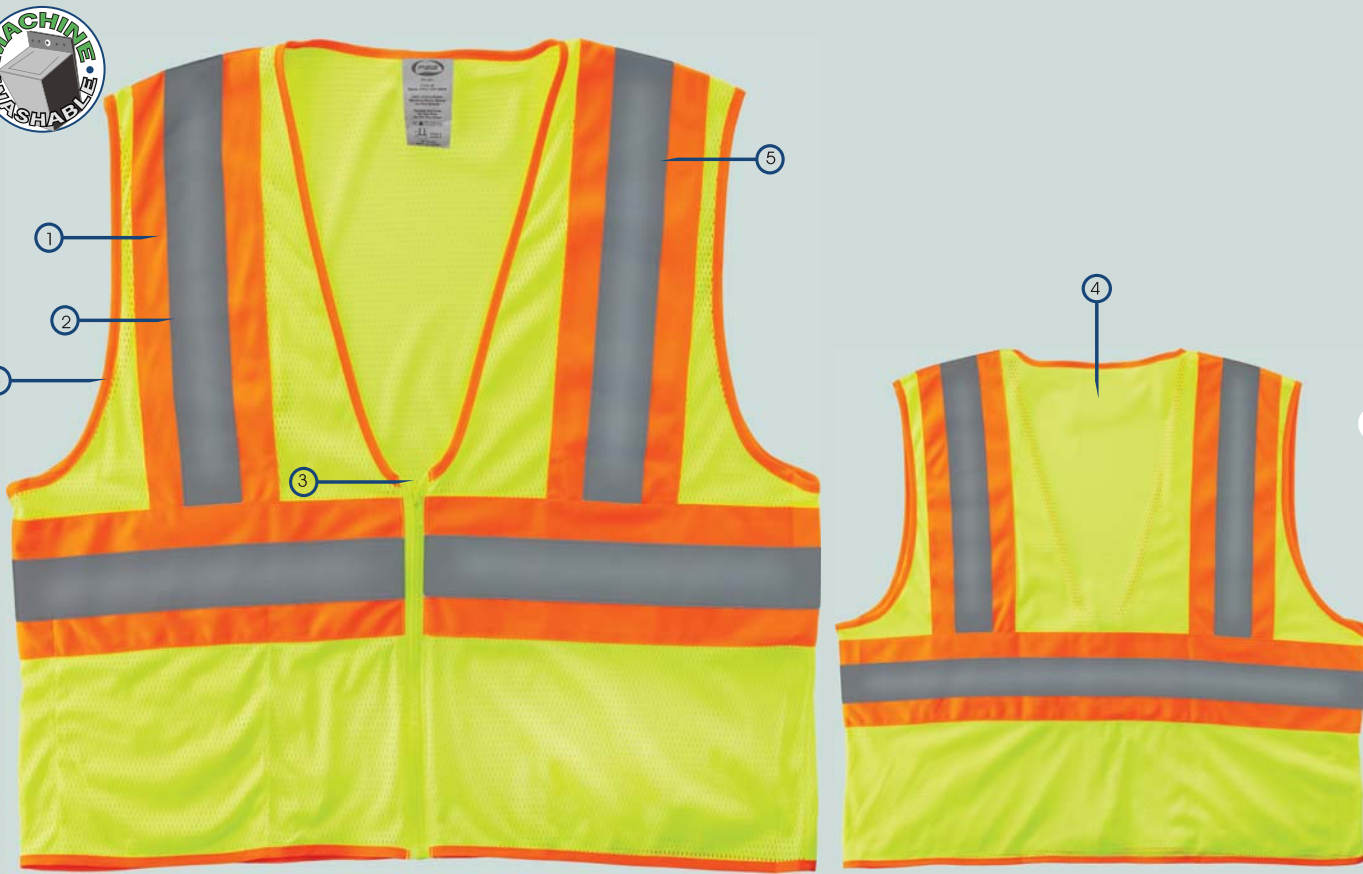
SVZ2T-206 Available S-8XL

Alternate version available with 3M reflective tape (SVZ2T3M-206).